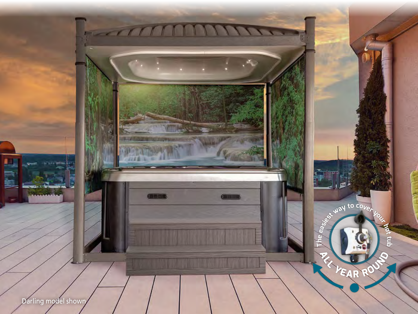
Darling model shown

The easiest way to cover your hot tub ALL YEAR ROUND