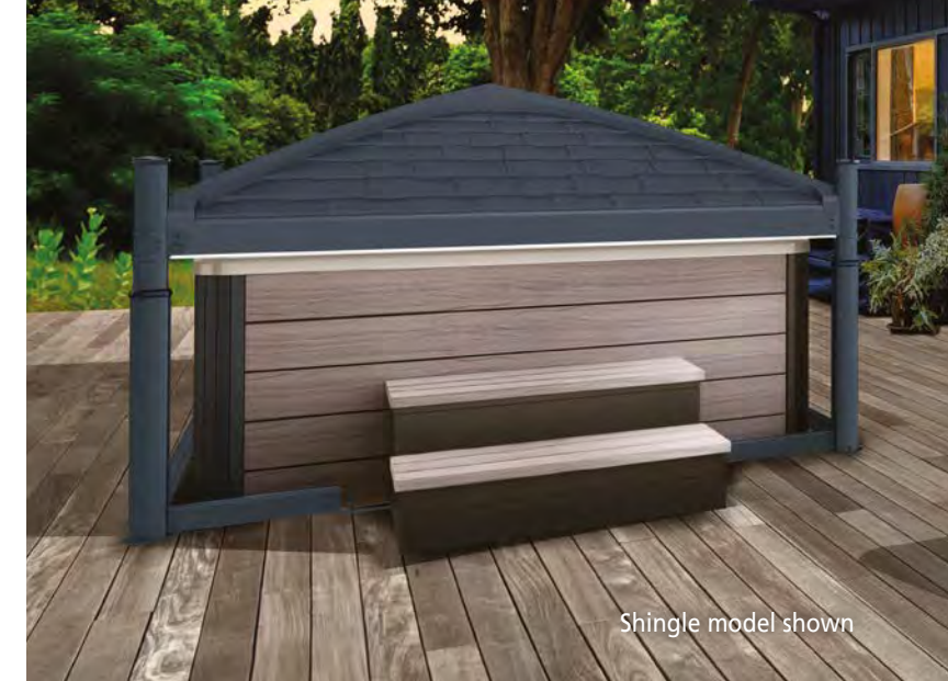
Shingle model shown